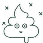
Dog poop bags