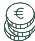
Additional cost requested