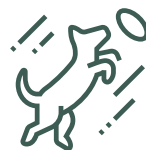
Canine freedom zone