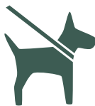
Dog on lead