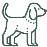
Dog not categorized